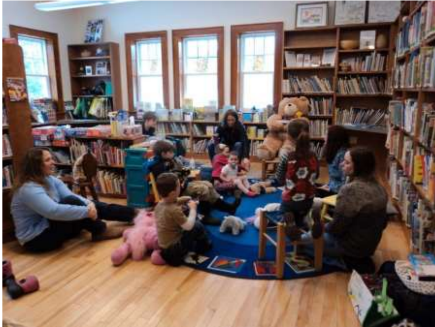
Teddy reading to patrons during the Teddy Bear Sleepover at the Philip Read Memorial Library.