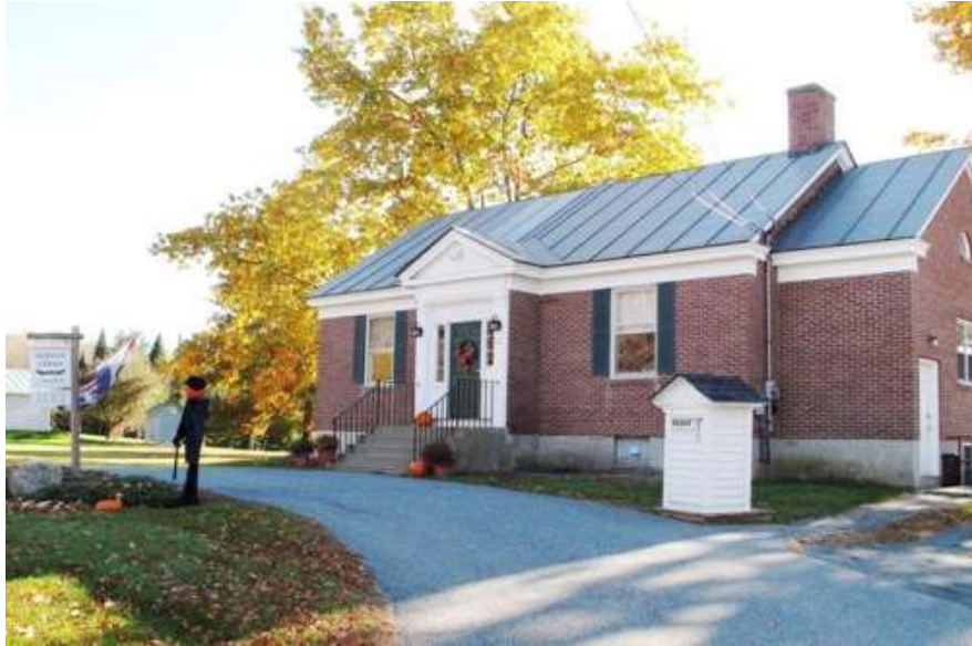
Fall at the Meriden Library, a great time for a book!